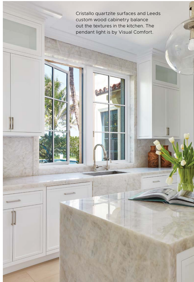
Cristallo quartzite surfaces and Leeds custom wood cabinetry balance out the textures in the kitchen. The pendant light is by Visual Comfort.

To accentuate the framework established by the dwelling's serene architecture by Roger Janssen, the palette chosen was inspired by the ocean blues of the Mediterranean and the white patina that's so ubiquitous on seaside villas in Greece. The colors complement Janssen's work in all areas of the home, but particularly in the living room, where a staircase in a floor-to-ceiling grid of metal-framed glass creates a dramatic focal point. "The idea was to keep the views open," says Kah. "When you stand on the stairs you can see the ocean and beyond."