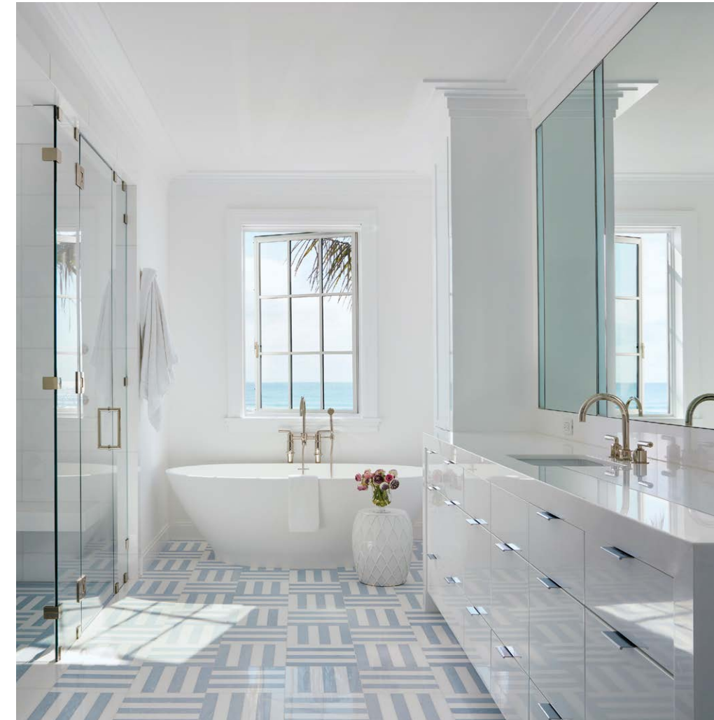
BELOW: Leeds cabinetry, Thassos marble, fixtures by Waterworks, and a soaking tub by Victoria + Albert give the primary bathroom its spa feeling.

form of the light velvet that covers two Holly Hunt side chairs (an ideal counterpoint to all the white in this space). In the dining room, shades of navy and cerulean alert the eye to various ceramics on the dining table and a striking artwork of a resting leopard by Helmut Koller. Upstairs, in the primary suite, the hue (with hints of turquoise and green) takes over the walls, the ceiling, the window treatments, a seating nook, the bed frame, and even the art. “We just went for saturation,” says Kah, “and it worked.”