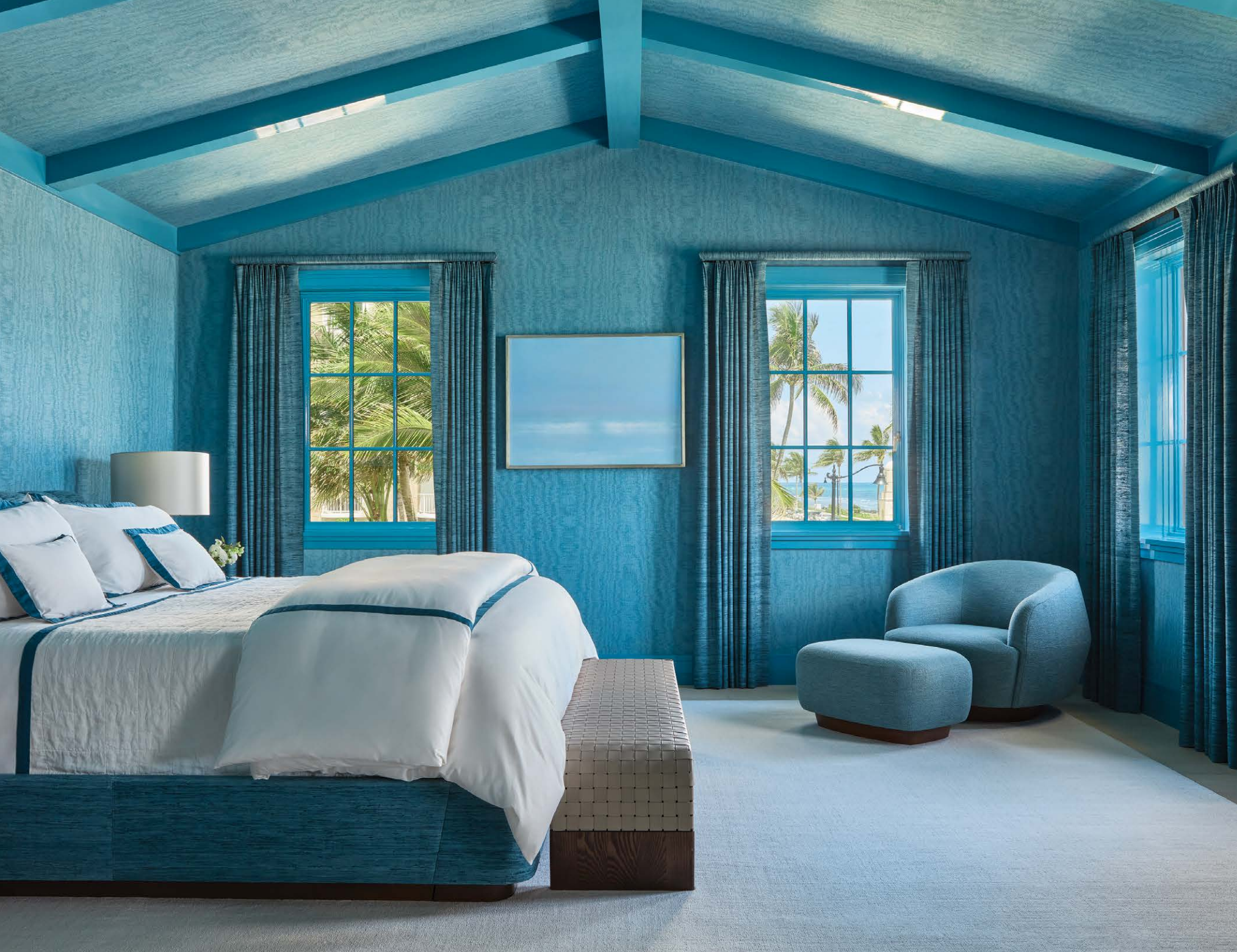
LEFT: The primary suite is saturated in blue with Dedar drapes, an Armani/Casa wallcovering, and a bed, club chair, and ottoman by Holly Hunt. The taupe Rosenfeld area rug complements the white oak floor.